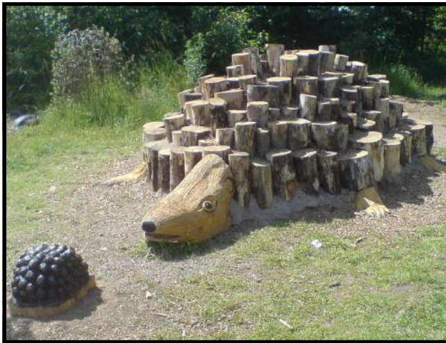
The old hedgehog

I started with a small resin model and made a plaster cast of the head. This was then drawn with contour lines, photographed and blown up on our projector. The profiles were then drawn and cut out to create a pattern.