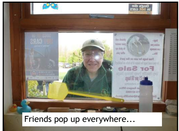
Friends pop up everywhere...