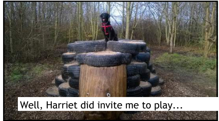
Well, Harriet did invite me to play...