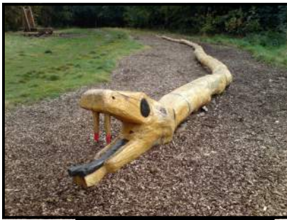
The old snake

I was asked to design and cost a new snake. A large group of friends were introduced to the texturing of the body using skills of routing and wood carving with hand tools. They produced a scale pattern which looks brilliant! The snake was then taken to the timber yard and tanned.